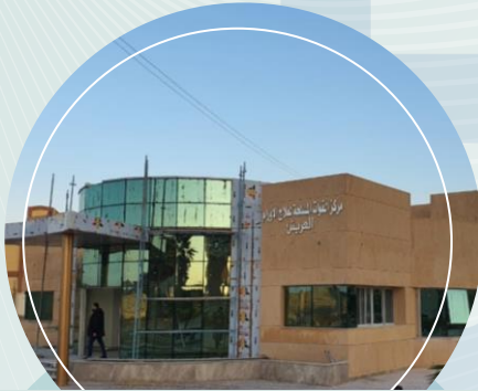
ARISH ONCOLOGY CENTER