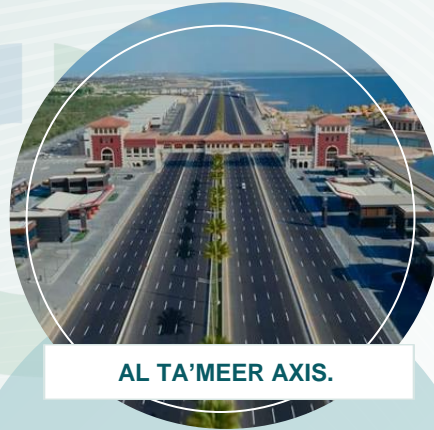
AL TA'MEER AXIS.