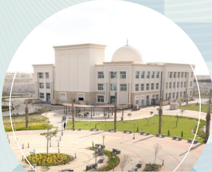
NEW MANSOURA UNIVERSITY - MANSOURA