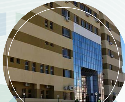
ASWAN GENERAL HOSPITAL