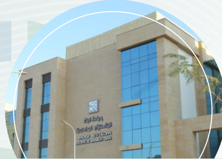
THE FACULTIES OF MEDICINE, HUMANITIES AND INFORMATION SCIENCES - GALALA UNIVERSITY