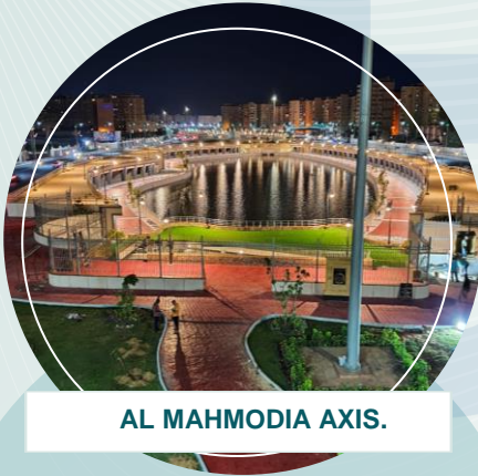
AL MAHMODIA AXIS.