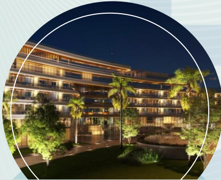
NAZLY & NARIMAN HOTELS